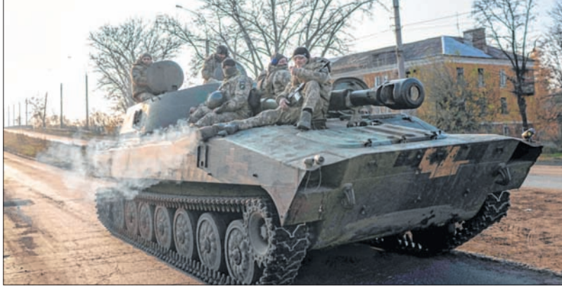
Ukrainian soldiers ride on a 2S1 Gvozdika outside Bakhmut, Ukraine, on Wednesday