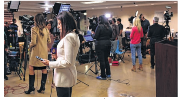
TV reporters work inside the Maricopa County Tabulation and Election Centre on Wednesday in Phoenix, Arizona