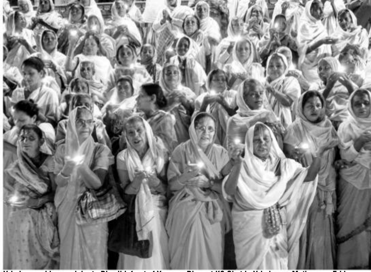
Vrindavan widows celebrate Diwali infront of Yamuna River at KC Ghat in Vrindavan. Mathura on Fridav

"What was the stance of the BJP then and what sort of doublespeak is the BJP doing today," he said, accusing the saffron party of displaying "hunger for power".