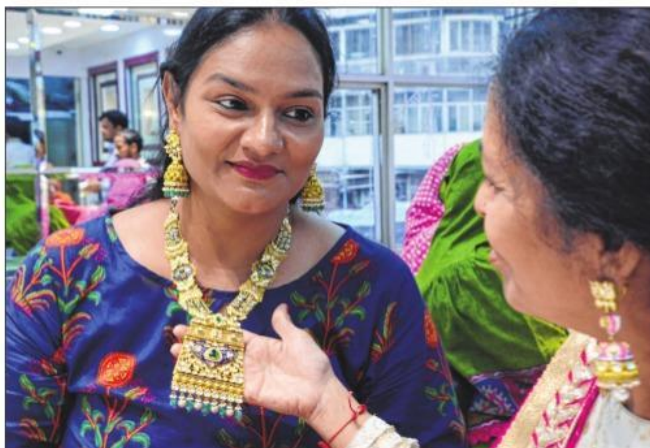
People buying gold on Dhanteras at a popular jewellery store in Mumbai on Friday

The bench was dealing with a matter pertaining to an illegal structure at a South Mumbai area, wherein. the tenants had challenged the demolition notices issued by the